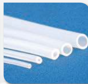
Siloflow PPI Silicone Tubing